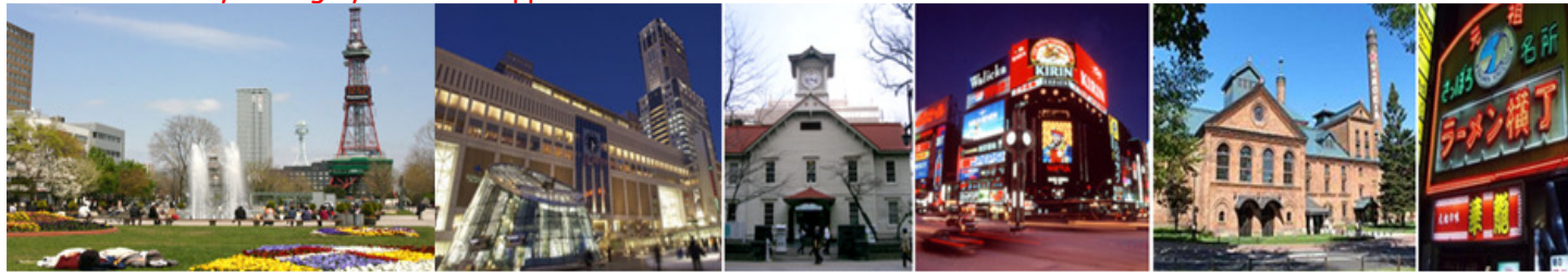
Sapporo Odori Park

Theme for today: Design your own Sapporo memories!!!