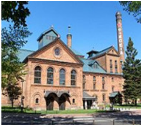
Sapporo Beer Factory